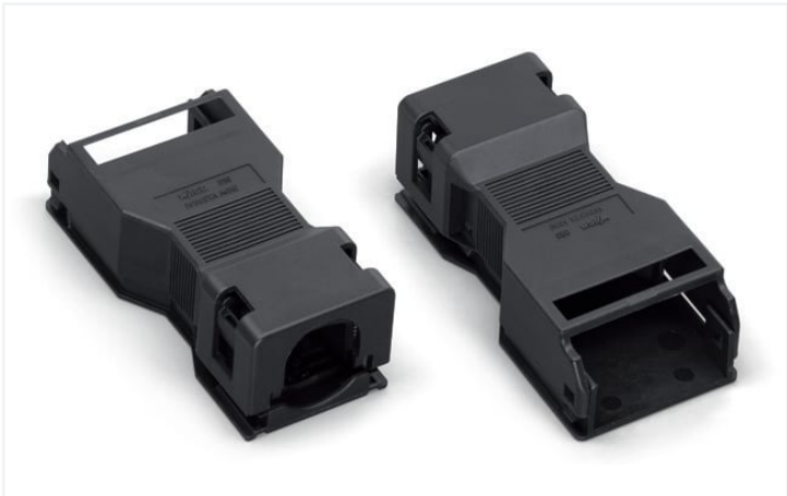
Color: ■ black