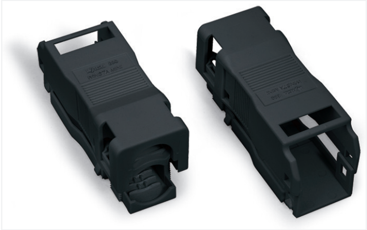
Color: ■ black