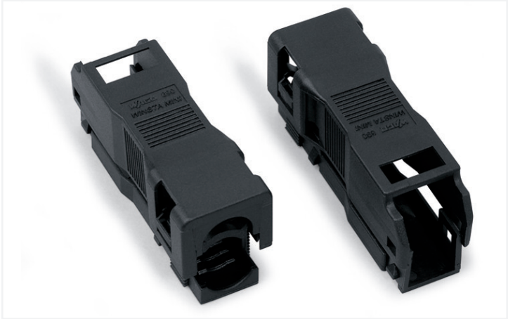
Color: ■ black