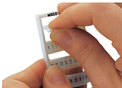
Separating a strip from the WMB or WMB marker card.