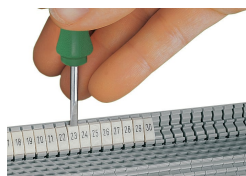
Snapping a WMB marker strip into the marker slot of the double marker carrier.