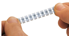
Stretching a WMB marker strip.