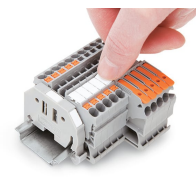
Snapping a marking strip into the marker slot.