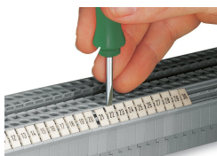
Snapping a marking strip into the marker slot.