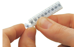
Separating an individual marker from the WMB marker strip – for larger terminal blocks.