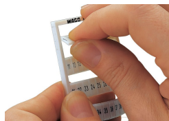
Separating a strip from the WMB or WMB marker card.