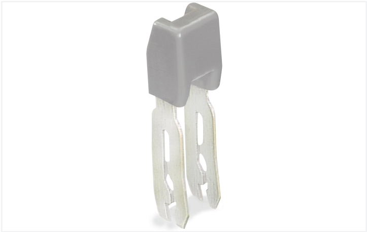
Color: ■ gray Similar to illustration