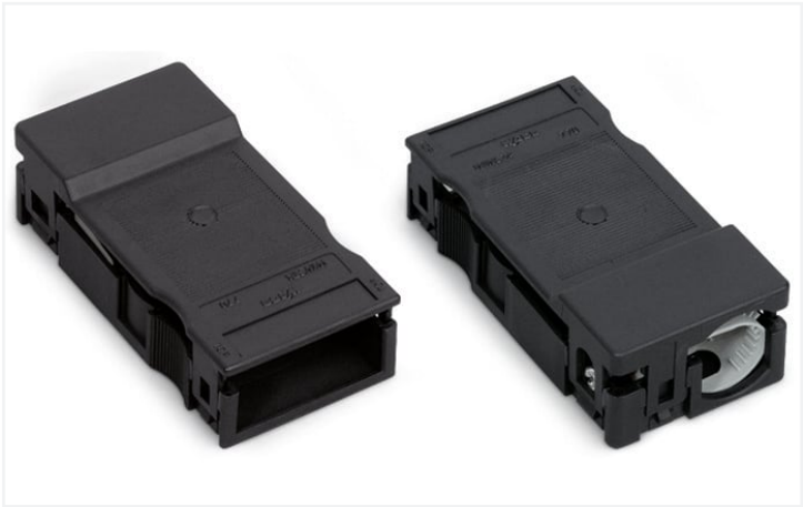
Color: ■ black