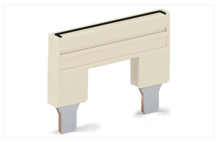
Color: I light gray