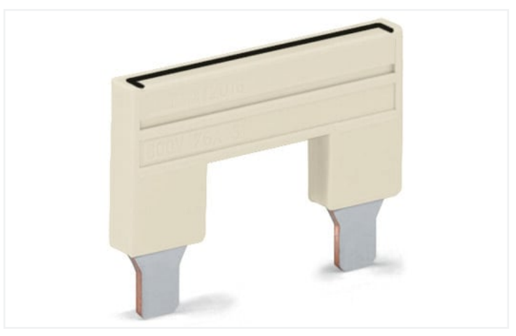
Color: ■ light gray