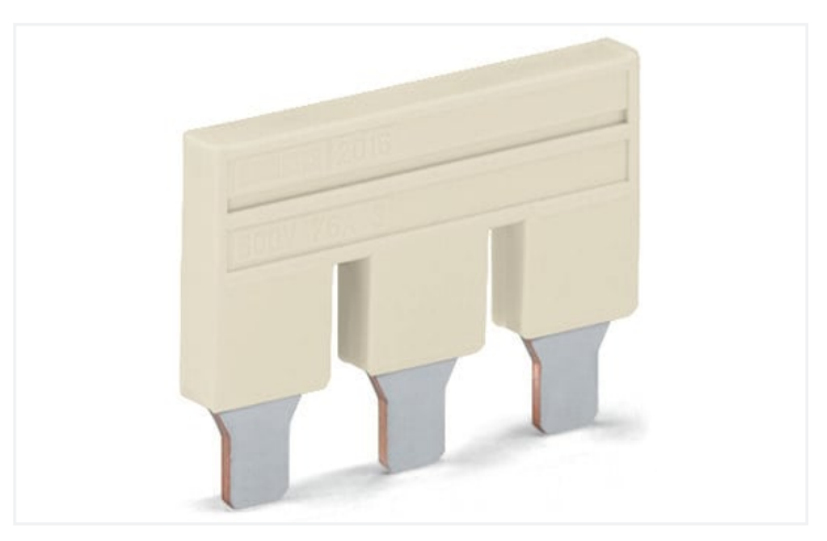
Color: ■ light gray