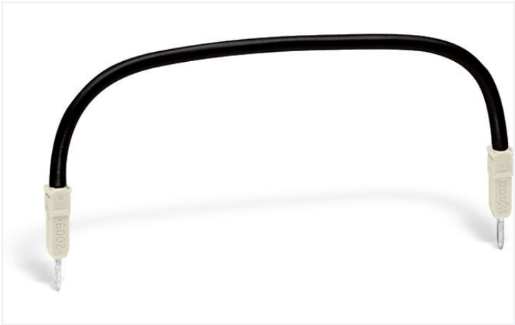
Color: ■ black Similar to illustration