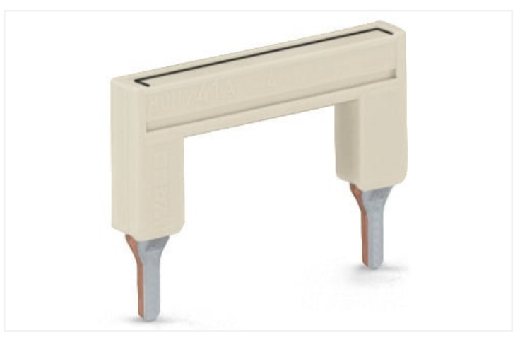
Color: ■ light gray Similar to illustration