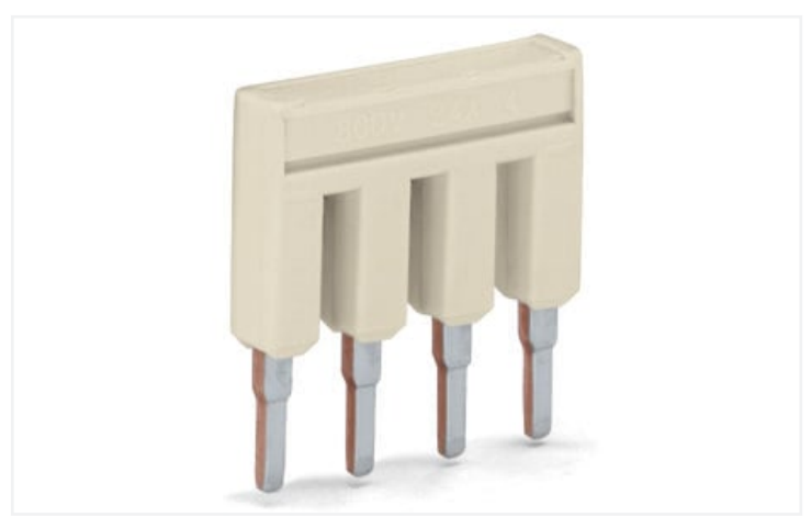
Color: ■ light gray Similar to illustration