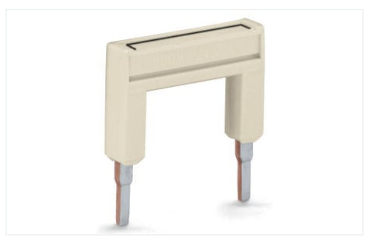
Color: ■ light gray Similar to illustration