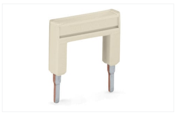
Color: ■ light gray Similar to illustration