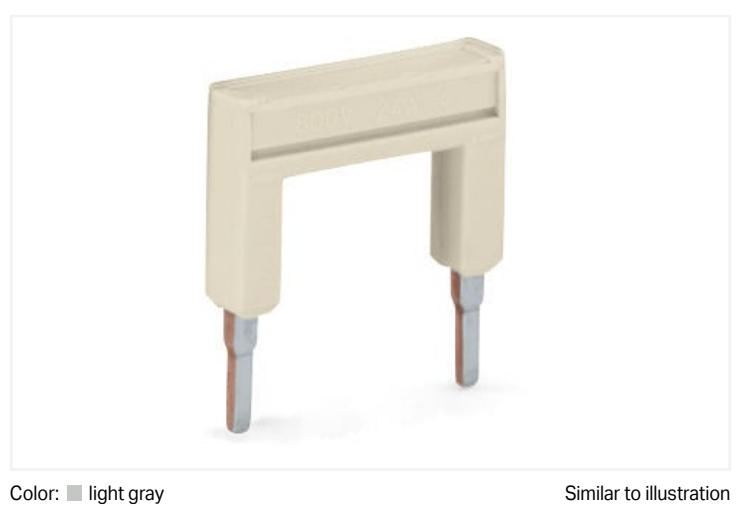
Color: ■ light gray