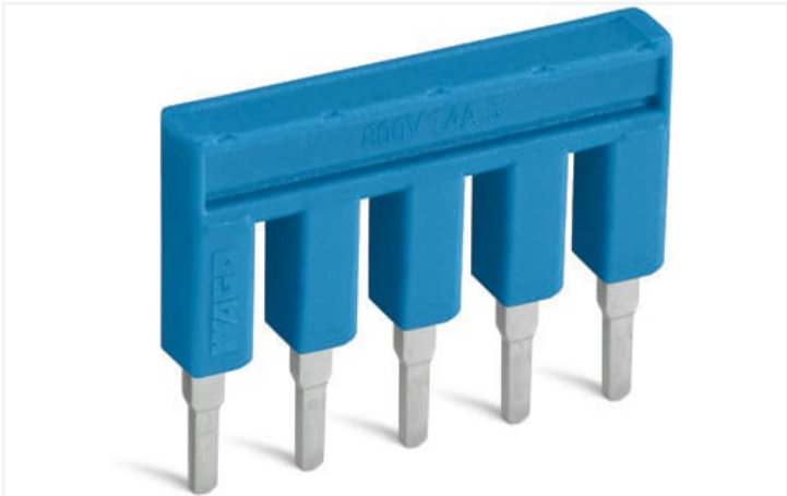
Color: ■ blue Similar to illustration