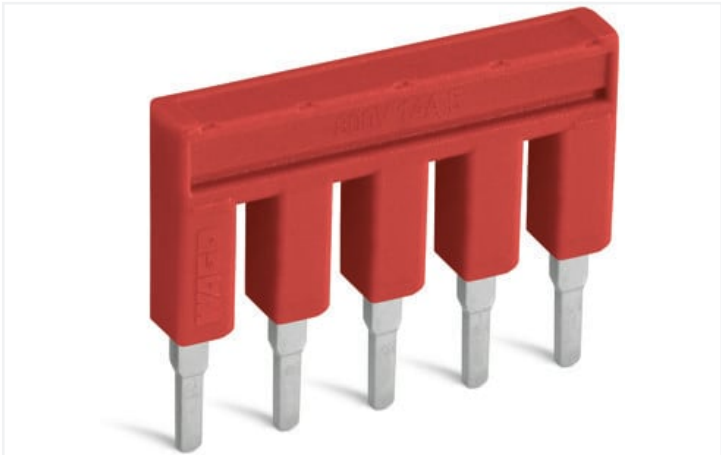
Color: ■ red Similar to illustration