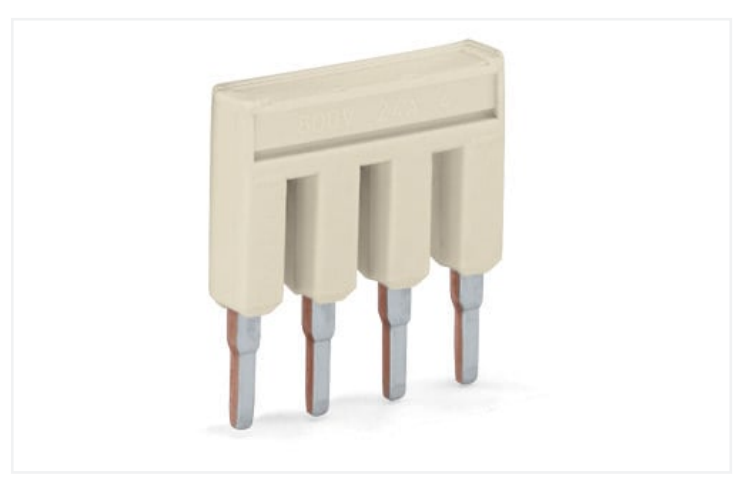
Color: ■ light gray Similar to illustration