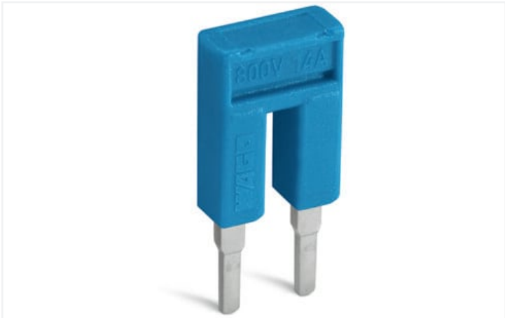
Color: ■ blue Similar to illustration